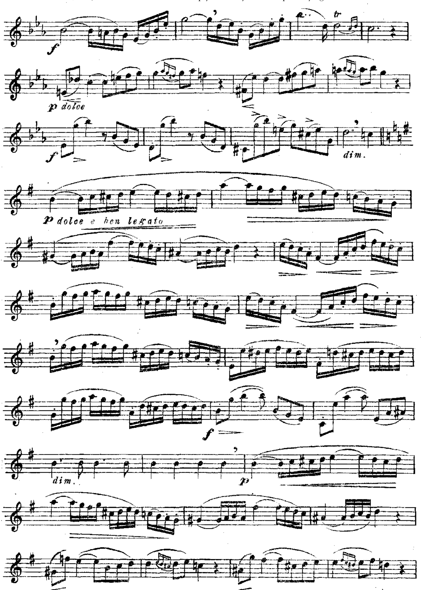
Try The Ultimate Warm Up Book, The Ultimate Technical Study, and The Ultimate Wedding Book A. 908 O.