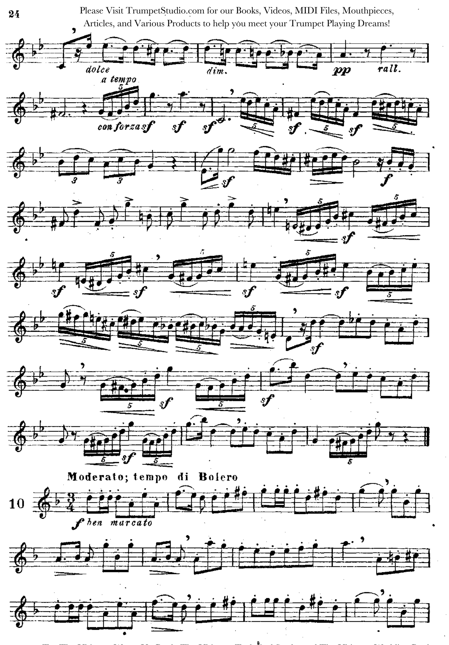
Try The Ultimate Warm Up Book, The Ultimate Technical Study, and The Ultimate Wedding Book