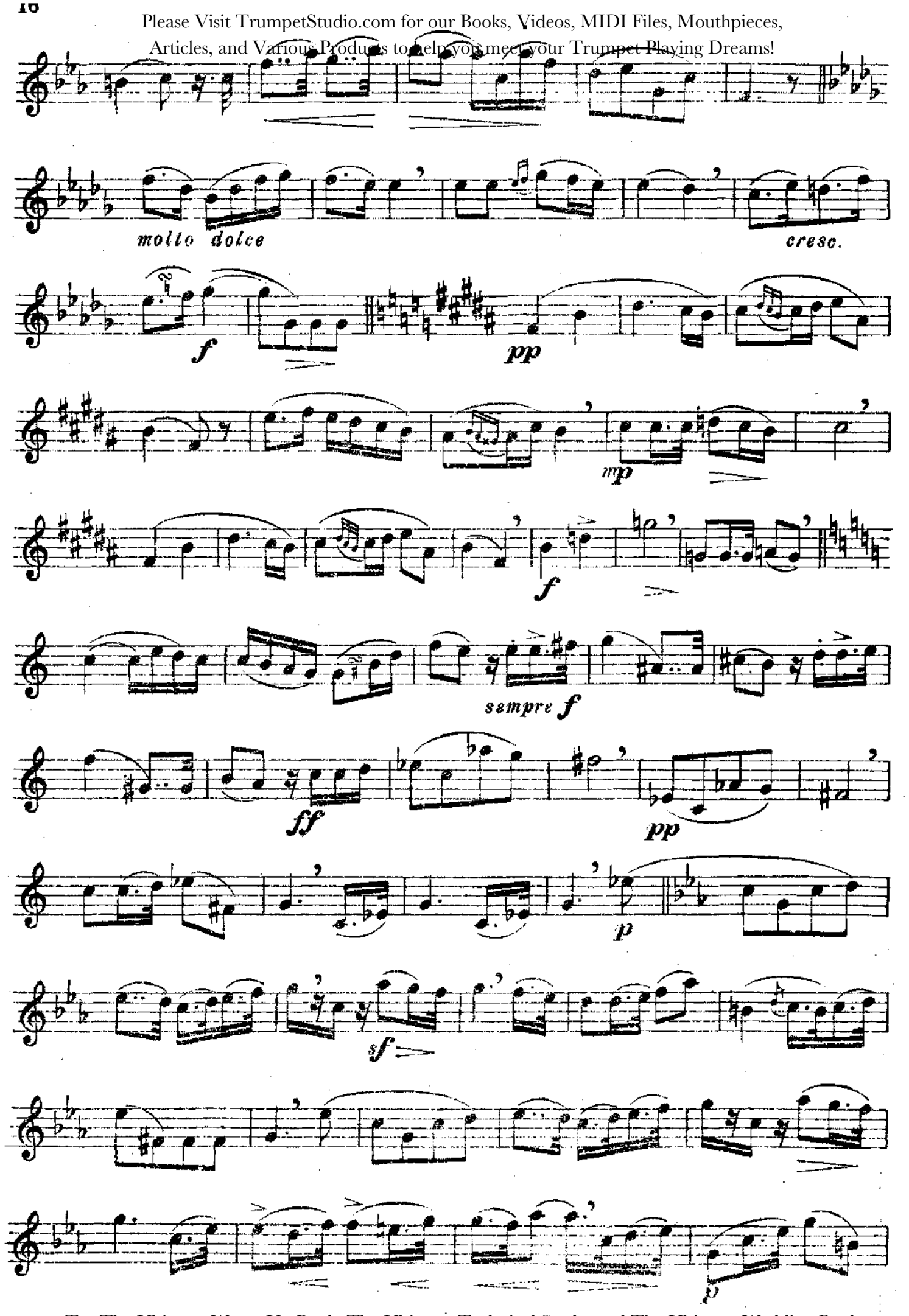
Try The Ultimate Warm Up Book, The Ultimate Technical Study, and The Ultimate Wedding Book