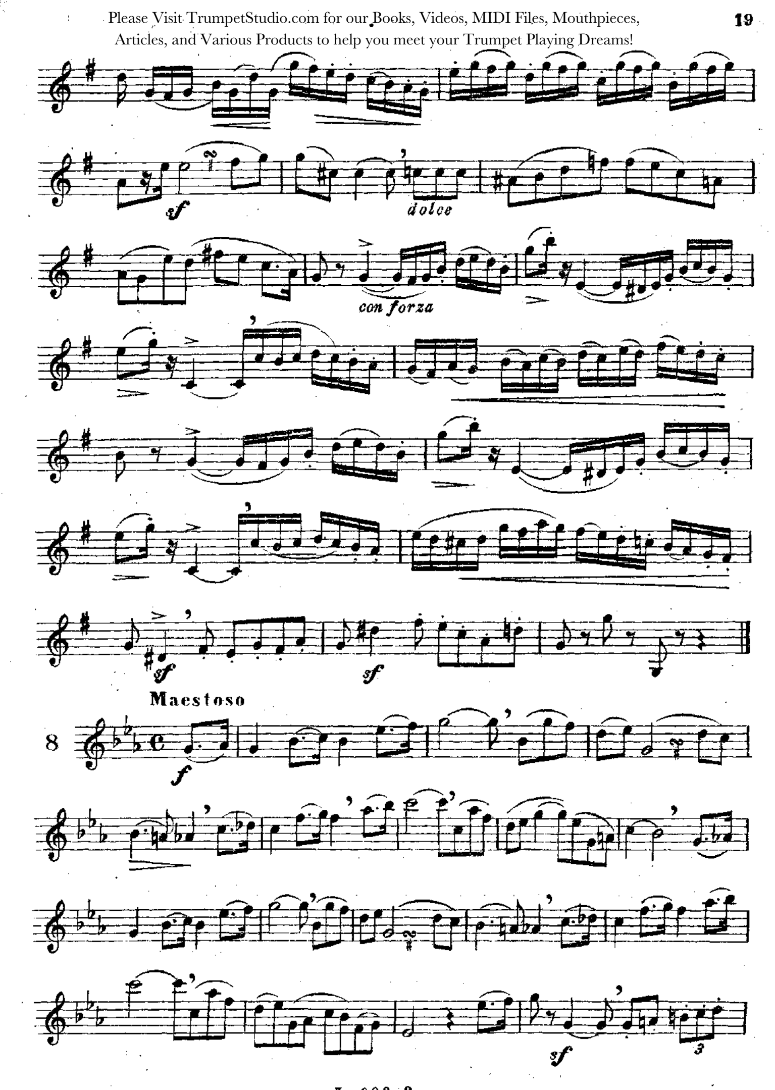
Try The Ultimate Warm Up Book, The Ultimate Technical Study, and The Ultimate Wedding Book