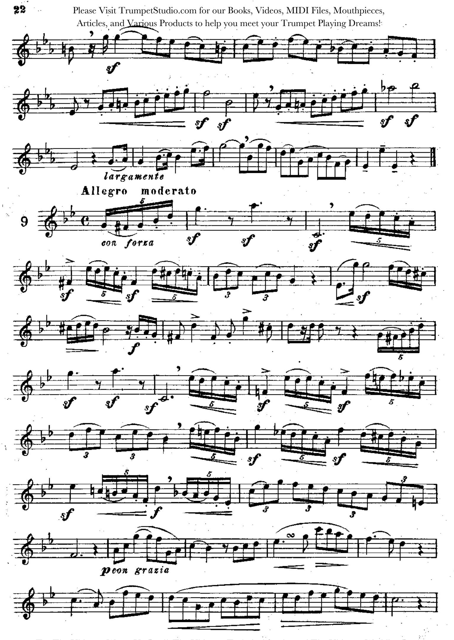
Try The Ultimate Warm Up Book, The Ultimate Technical Study, and The Ultimate Wedding Book